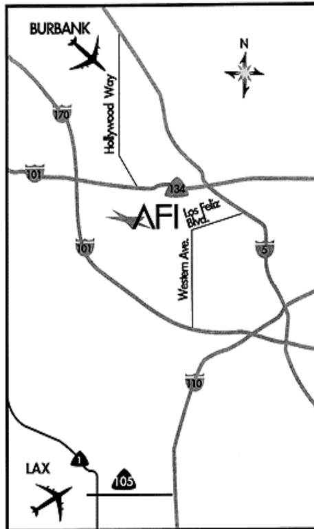
Airports and Freeways to AFI Campus

If you are heading east on Franklin Ave., turn left (north). The AFI campus is half-way up the hill on the left. Turn into the driveway and go up the hill (past Immaculate Heart High School). The first building on your left is the Warner Building, where many auditions for student films are held. To get to the SAG-AFTRA Los Angeles Conservatory, continue driving further up the hill. As you veer left, you'll see a white two-story building, the Mayer Library Building. The SAG-AFTRA Conservatory office is located in LIB 100 on the ground floor. The studio, classroom and the Frankovich/Barnes screening room are also located on the ground floor.